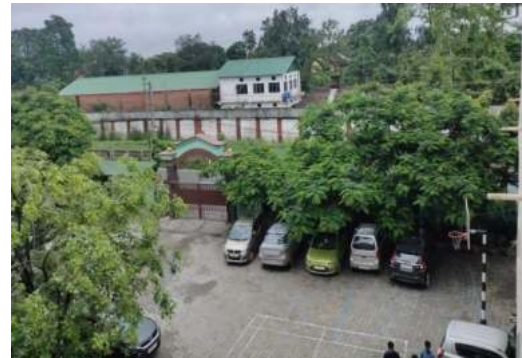
Green Campus Initiative (Natural Car Shed)