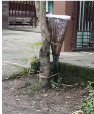
Dustbins made of bamboo used by the College