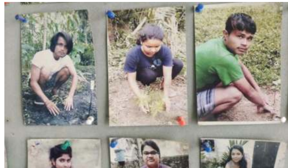
Photos of Plantation programmes of the College