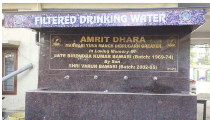
Water filter and drinking water tank with taps