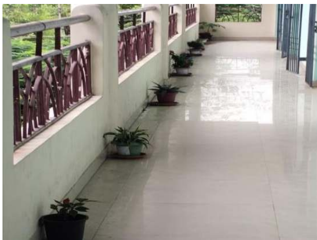
Green Campus Initiative- Indoor Plants