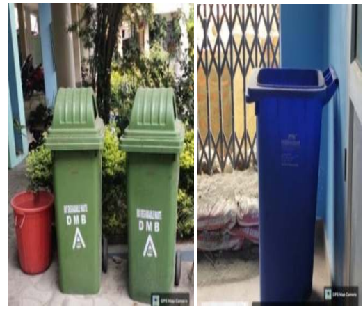
Maintenance of two types of dustbins