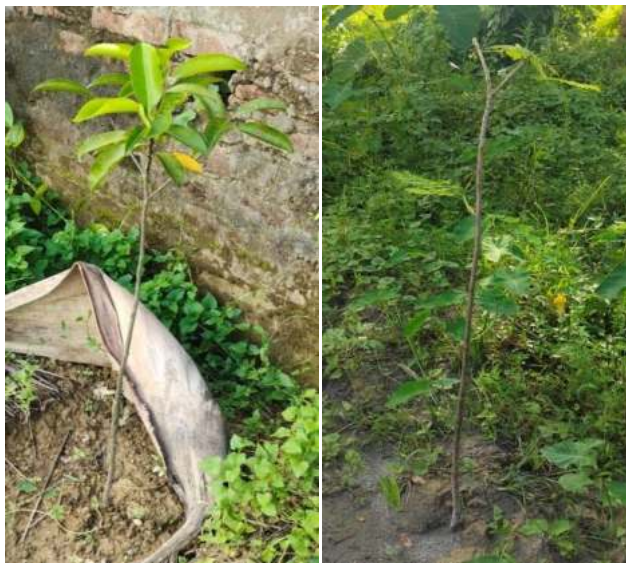
New saplings of Bokul and Rain tree