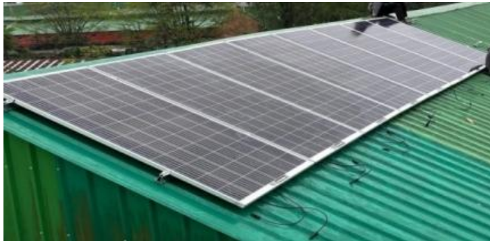
Solar Panel on the roof top