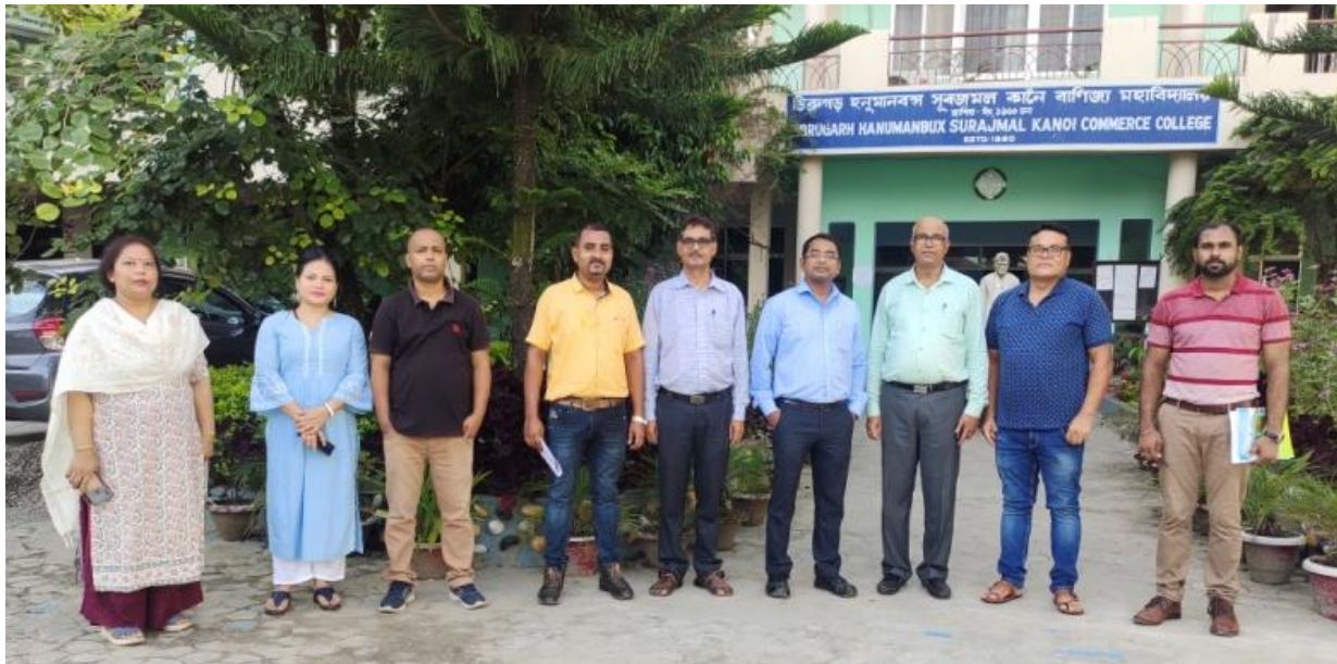
A group photo with the Principal and faculty members