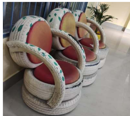
Chair made from used Car Tyre