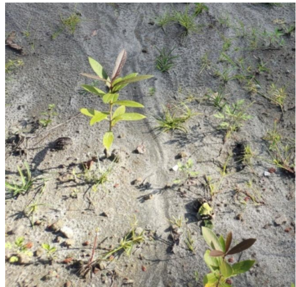
Natural Regeneration of Arjun tree