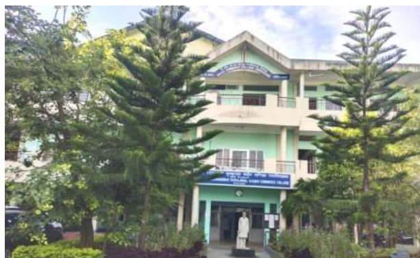
A view of the campus