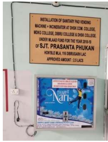
Sanitary napkin incinerators