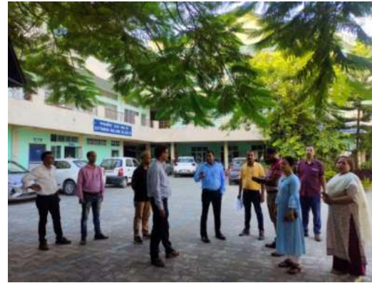
Discussion with the faculties